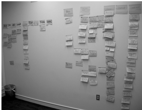
Figure 2. OpenView Labs Scrum Board

As part of planning, the ScrumMaster and team surface all dependencies and possible impediments, and the ScrumMaster works to remove all of them by mid sprint, and ideally by end of Monday.