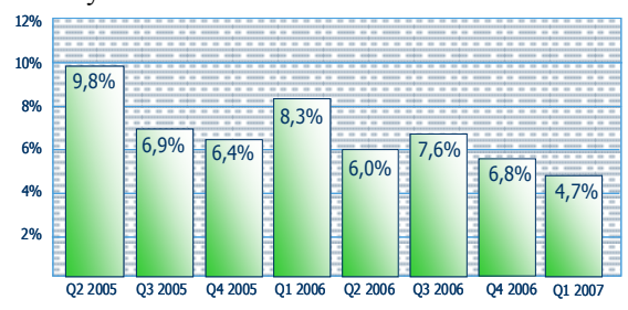
Figure 1 Rework at Systematic

At Systematic, CMMI Level 5 practices have reduced rework by 42%, maintained estimation precision deviation less than 10%, and assure 92% of all milestones are delivered early or on time. At the same time, extra work on projects has been significantly reduced.